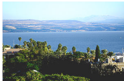
The Sea Of Galilee from bluffs over Tiberias