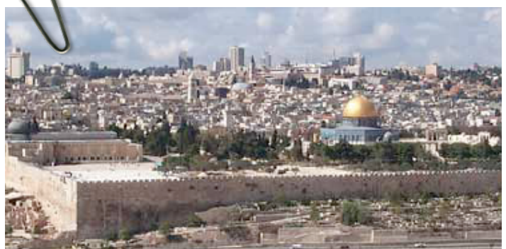
The view of Jerusalem from the Mount Of Olives